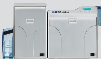
WISE-CL600 Laminator WISE-CXD80 Printer